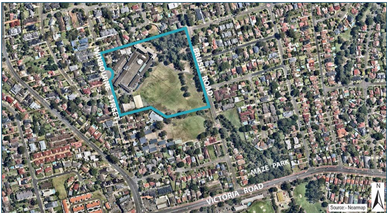
Figure 2 Site context