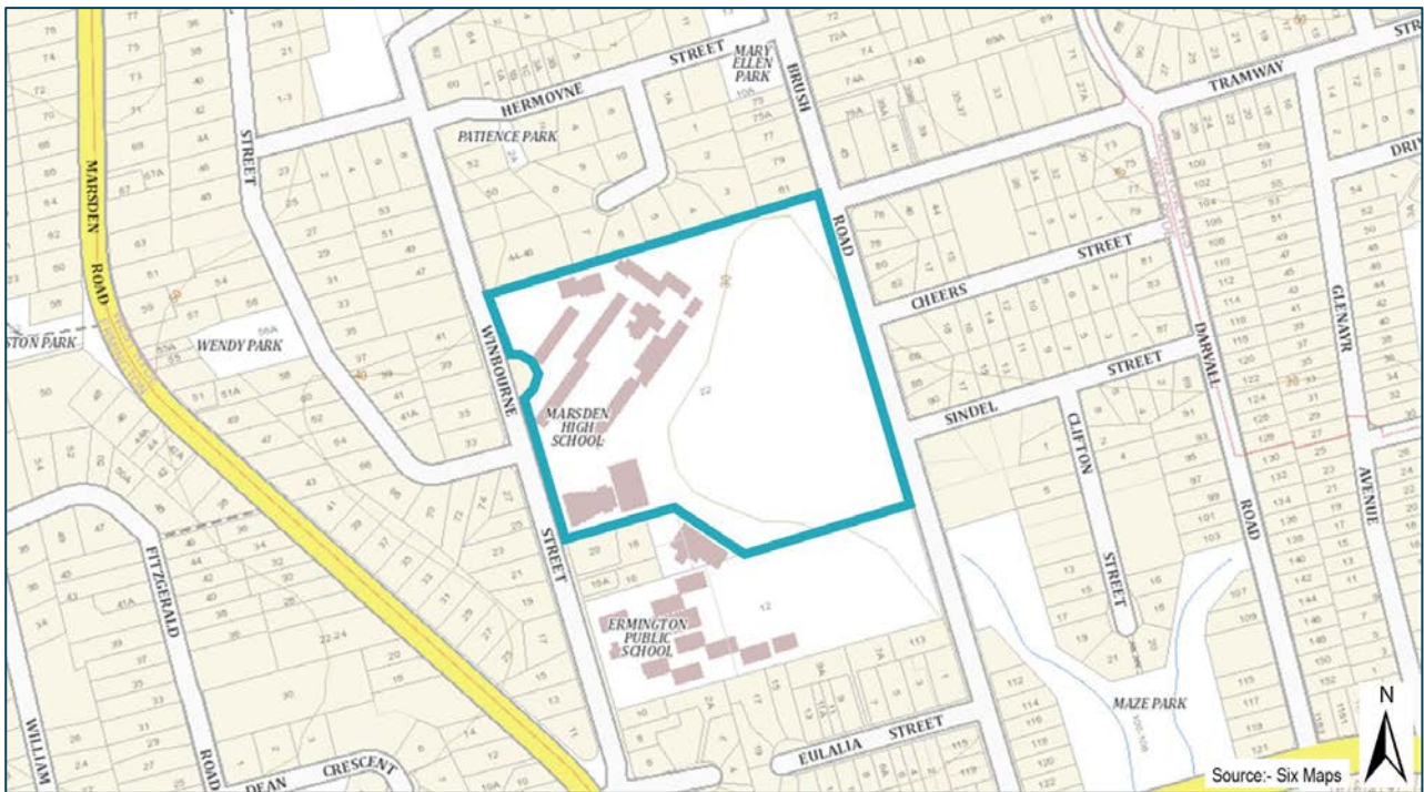
Figure 1 Subject site